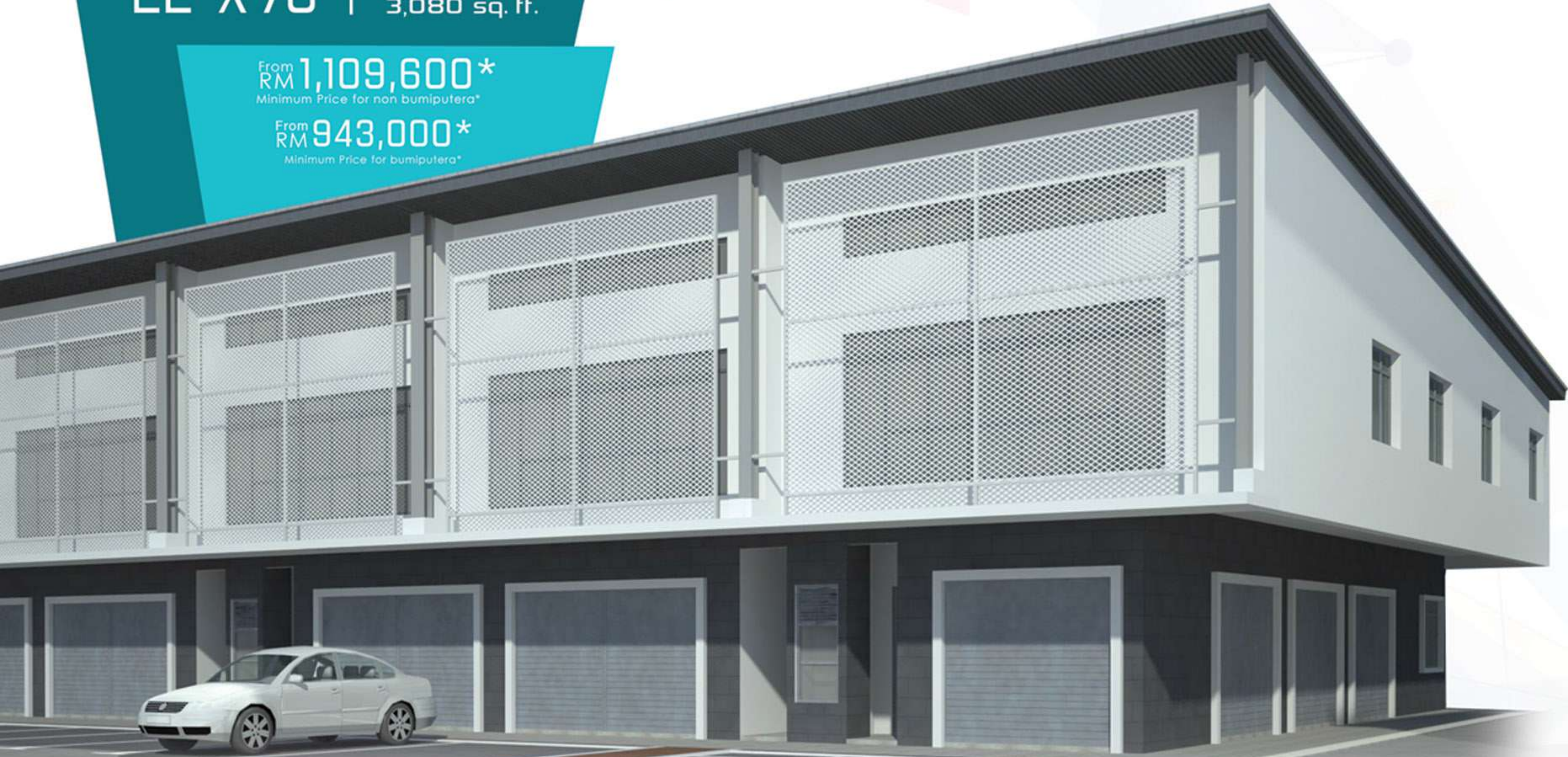
*Artist Illustration Only

From RM 943,000* Minimum Price for bumiputera*